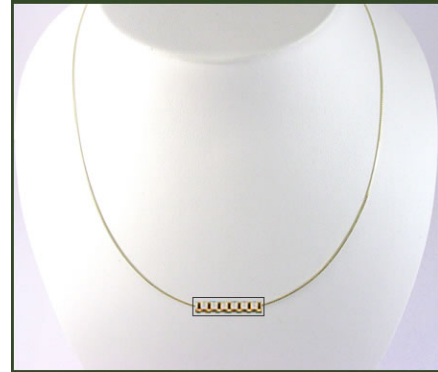
Item 1040 Enlarged to show detail

Venetian chains require a high degree of precision and high quality surface finishing in their fabrication. Our Venetian chains are made in our Attleboro, MA facility allowing us the ability to control all aspects of the process providing our customers with a product that meets the highest quality standards.